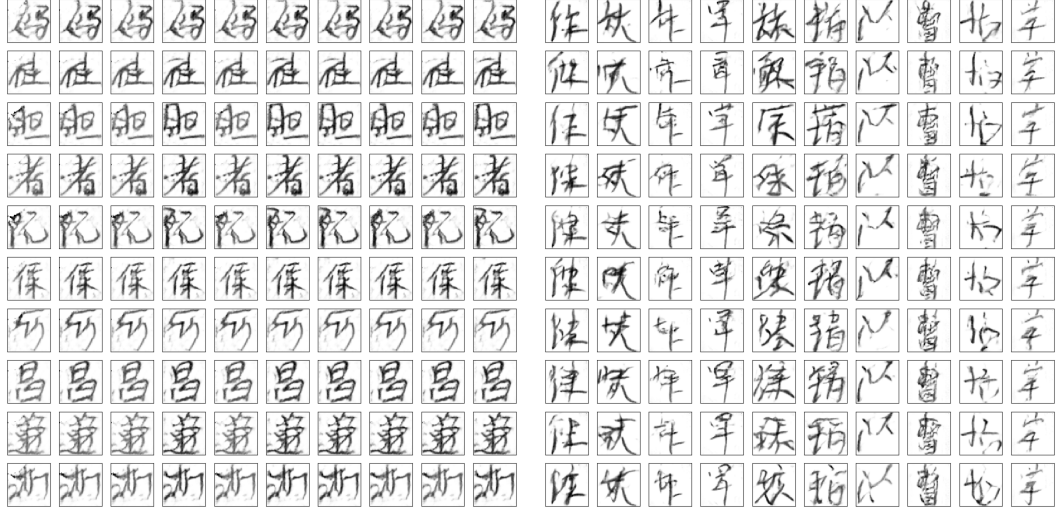
(a) Sample results of the cCGAN model trained with 10 labels. (b) Sample results of the cCGAN model trained with 100 labels.