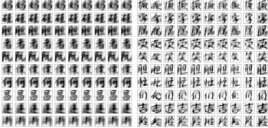
(a) Sample results of the cVAE-cCGAN model trained with 10 labels. (b) Sample results of the cVAE-cCGAN model trained with 100 labels.