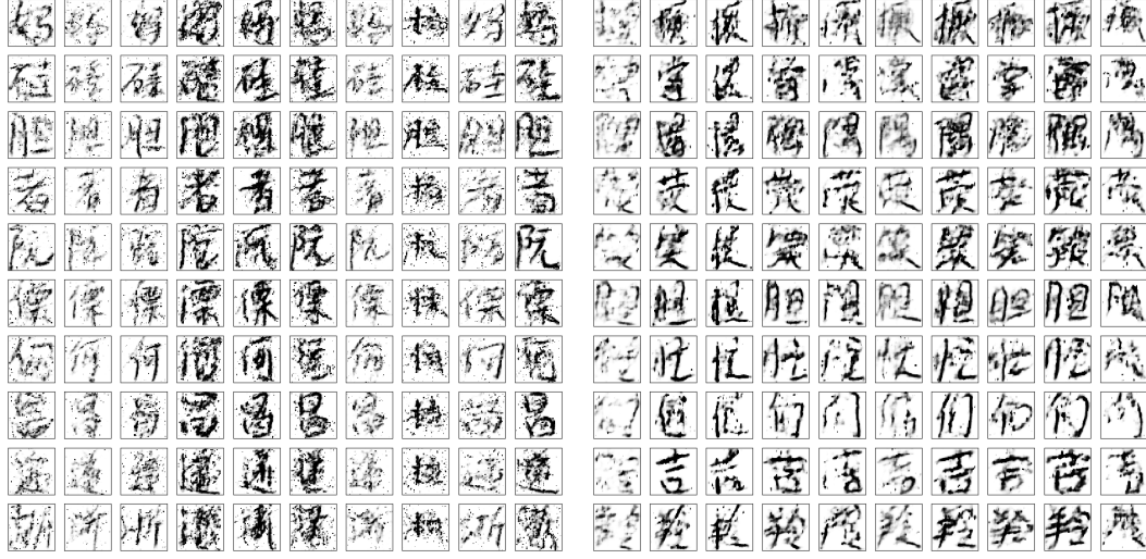
(a) Sample results of the cCVAE model trained with 10 labels. (b) Sample results of the cCVAE model trained with 100 labels.